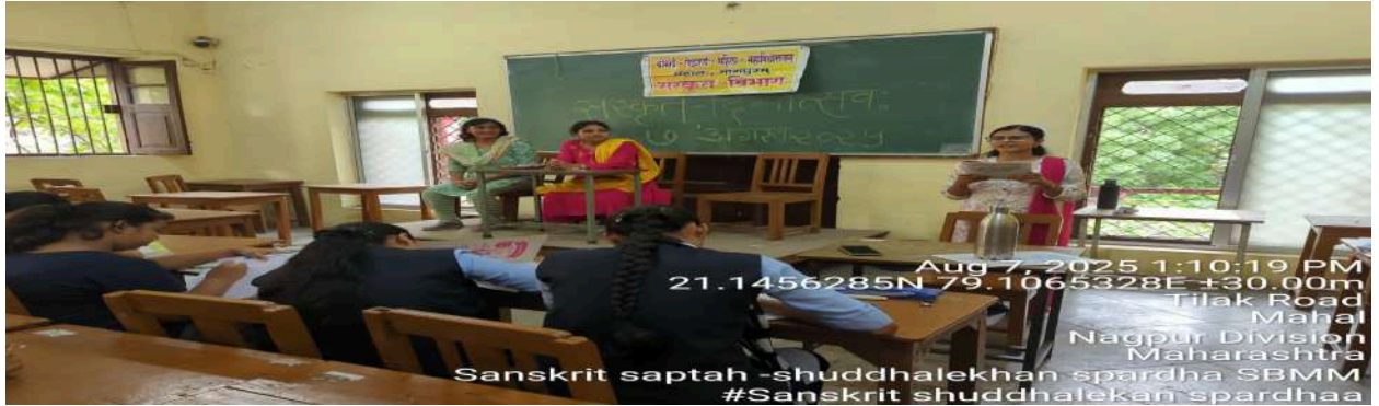
Aug 7, 2025 1:10:19 PM 21.1456285N 79.1065328E ±30.00m Tilak Road Mahal Nagpur Division Maharashtra Sanskrit saptah -shuddhalekhan spardha SBMM #Sanskrit shuddhalekhan spardha