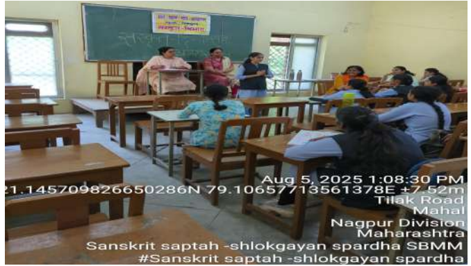
Aug 5, 2025 1:08:30 PM 21.145709826650286N 79.10657713561378E ±7.52m Tilak Road Mahal Nagpur Division Maharashtra Sanskrit saptah -shlokgayan spardha SBMM #Sanskrit saptah -shlokgayan spardha