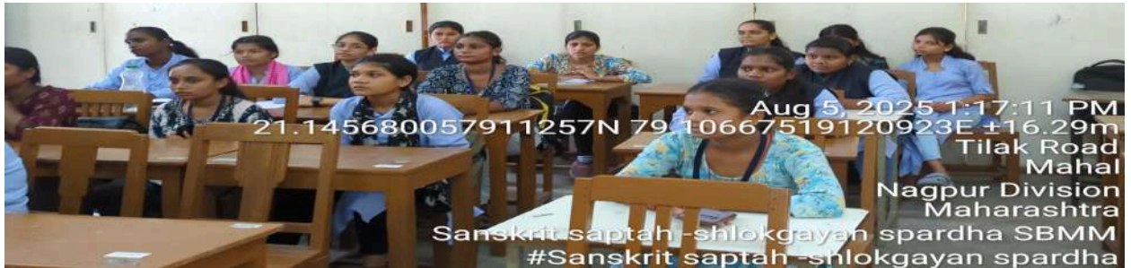
Aug 5, 2025 1:17:11 PM 21.145680057911257N 79.10667519120923E ±16.29m Tilak Road Mahal Nagpur Division Maharashtra Sanskrit saptah -shlokgayan spardha SBMM #Sanskrit saptah -shlokgayan spardha