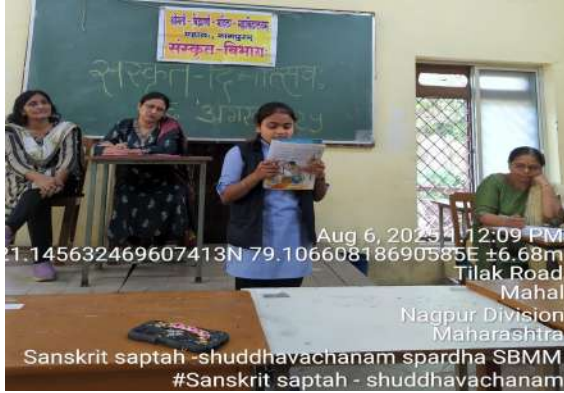
Aug 6, 2025 12:09 PM 21.145632469607413N 79.10660818690585E ±6.68m Tilak Road Mahal Nagpur Division Maharashtra Sanskrit saptah -shuddhavachanam spardha SBMM #Sanskrit saptah - shuddhavachanam