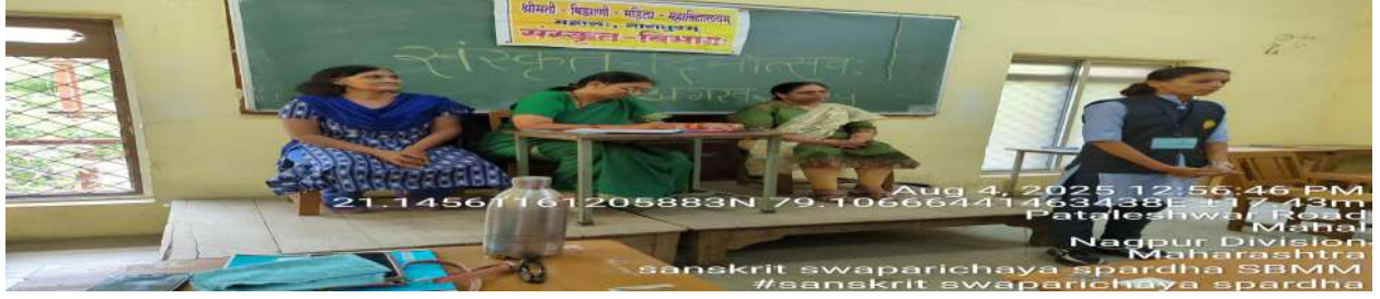
Aug 4, 2025 12:56:46 PM 21.14561161205883N 79.10666441463438E ±7.43m Pataleshwar Road Mahal Nagpur Division Maharashtra Sanskrit swaparichaya spardha SBMM #sanskrit swaparichaya spardha