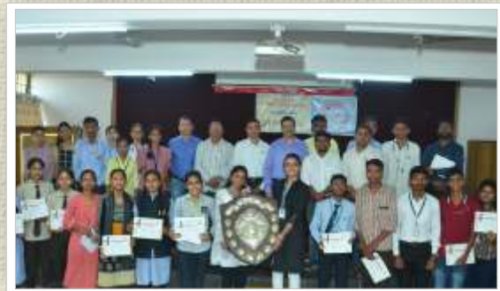
Inter Collegiate Sundar Vakrutva Spardha 2023