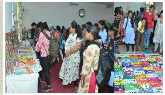
संस्कृत क्रिडनक आणि भितीपत्र प्रदर्शनी-संस्कृत विभाग