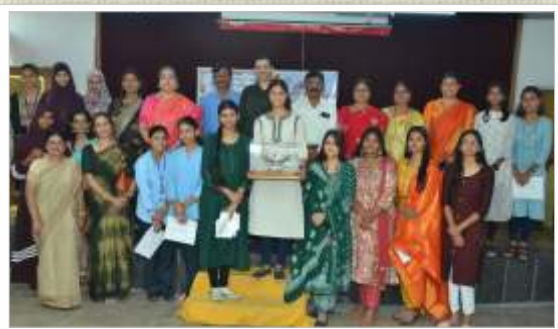
Inter Collegiate Nagdeo Ghazal Competition 2023