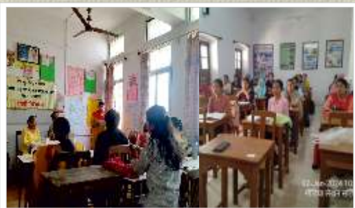
Certificate Course In Media Writing - Dept. of Hindi 2 to 18 Jan 2024