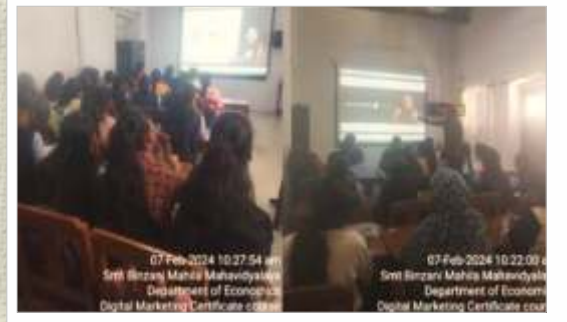
Certificate Course in Digital Marketing Dept. of Economics 23 Feb. to 18 March 2024