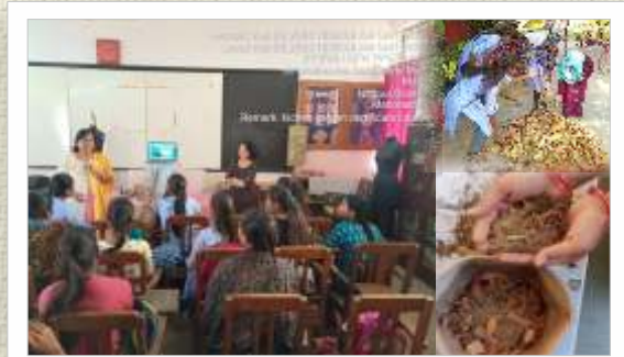
Kitchen Garden Certificate Course Dept. of Home Eco. 12 to 29 Feb. 2024