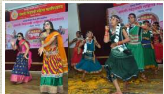
Cultural Event SBMM Utsav