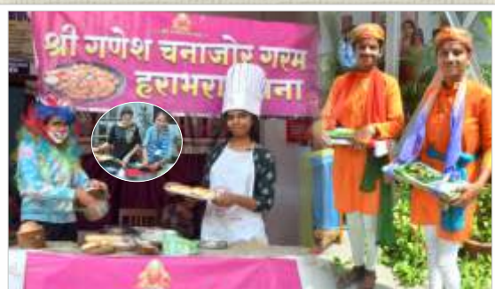
Anand Bazar 2023