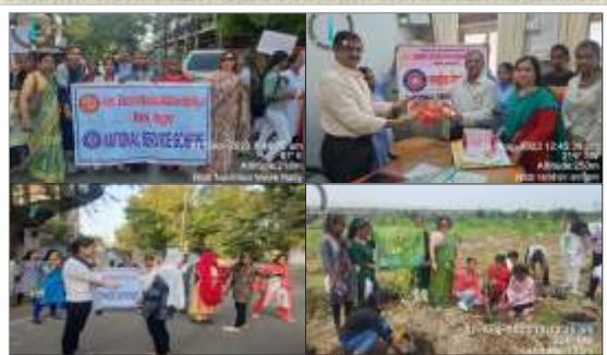
Activities by NSS Department