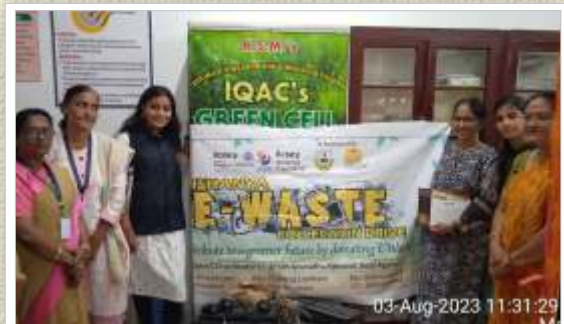
E-Waste Donation to Rotary Ishanya Foundation by IQAC's Green Cell