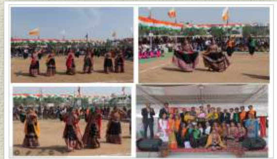
Glimpses of Cultural Program & Prize Distribution Ceremony of Republic Day