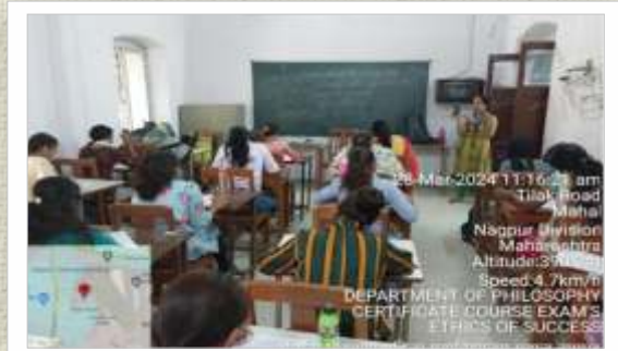
Certificate Course in Ethics of Success Dept. of Philosophy 12 to 29 Feb 2024