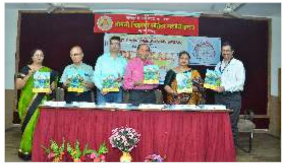
Deepkali Publication Ceremony on 16 July 2023 - College Foundation Day