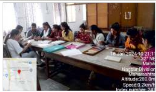
Certificate Course In Psychological Testing And Counselling Dept. of Psychology