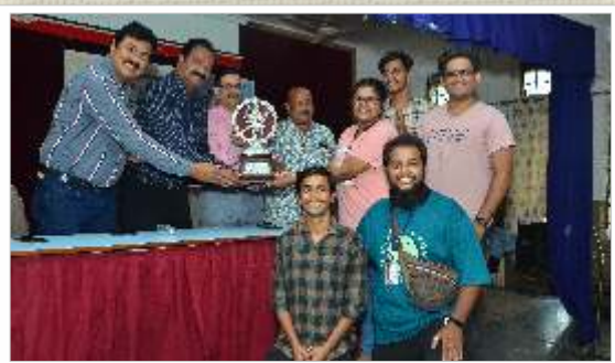
Inter Collegiate V.M. Damle Natyabhinay Spardha 2023