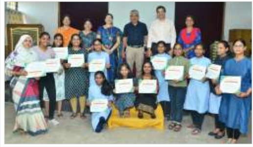
Certificate Course In Writing Skills -Dept of English 21 to 28 Aug. 2024