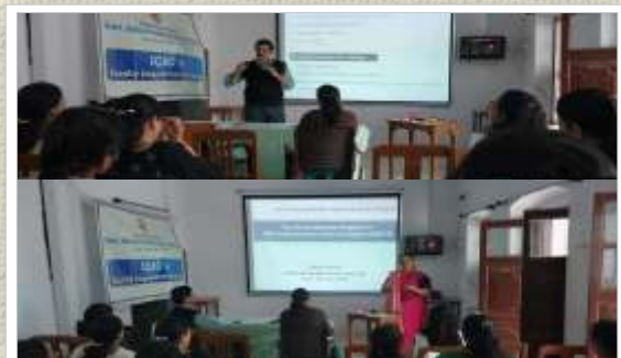
Faculty development Program on Implementation of NEP 2020 organised by IQAC