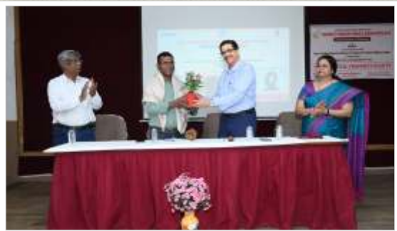
IPR Workshop by Dept. of Library & IQAC in Collaboration with Rajiv Gandhi National Institute of Patents Management