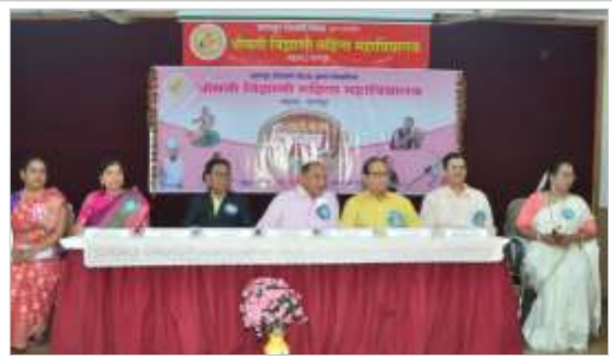
Inauguration Ceremony of SBMM Utsav