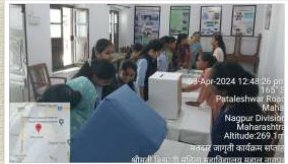
Voters Awareness Week Programme (Dept. of Pol. Sci.)