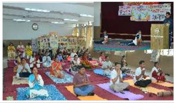
International YOGA DAY by Dept. of PHYSICAL EDUCATION & NSS on 21st June 2024