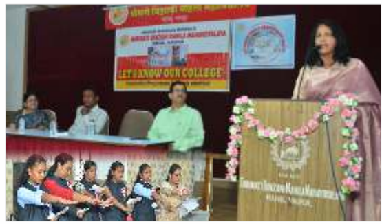
Installation Ceremony of VUM