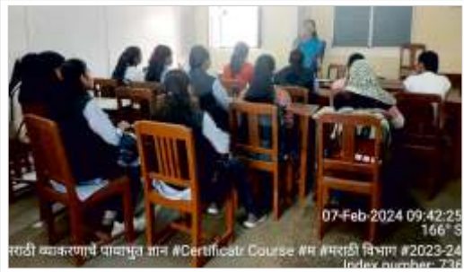
Certificate Course - Dept. of Marathi 24 Jan to 10 Feb 2024